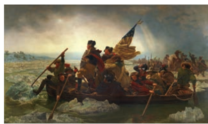
Washington Crossing the Delaware , 1851 Emanuel Leutze (Romanticism)