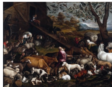
The Animals Entering Noah's Ark , c. 1570 Jacopo Bassano (Pre Baroque)