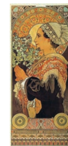
Thistle from the Sands , 1902 Alphonse Mucha (Art Nouveau)