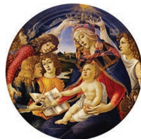
Madonna of the Magnificat , 1481 Sandro Botticelli (Renaissance)