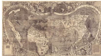
Universalis Cosmographia , 1507 Martin Waldseemüller (Renaissance)