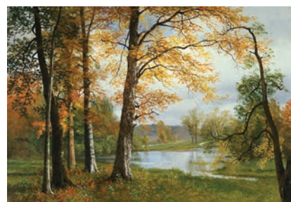
A Quiet Lake Albert Bierstadt (Romanticism)