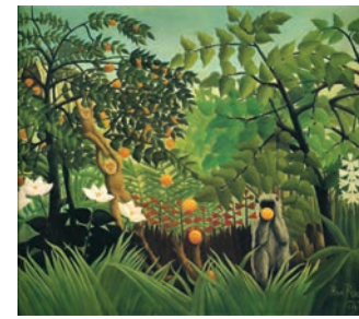
Exotic Landscape , 1910 Henri Rousseau (Modern Art - Naïve art)