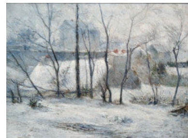
Garden Under Snow , 1879 Paul Gauguin (Post-Impressionism)