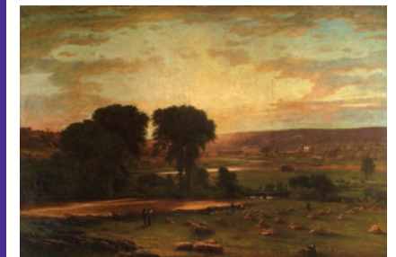
Peace and Plenty , 1865 George Inness (Romanticism)