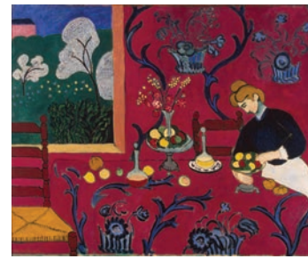
Red Room (Harmony in Red) , 1908 Henri Matisse (Modern Art - Fauvism)