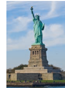
Statue of Liberty , dedicated 1886 Frederic Bartholdi (Neoclassicism)