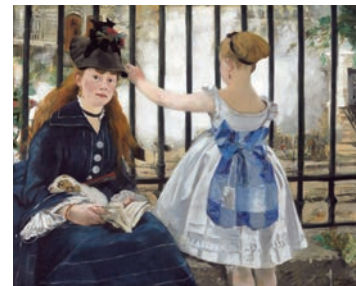
The Railway , 1873 Eduard Manet (Impressionism)