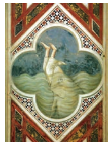
Jonah Swallowed up by the Whale , 1304-1306 Giotto di Bondone (Pre Renaissance)