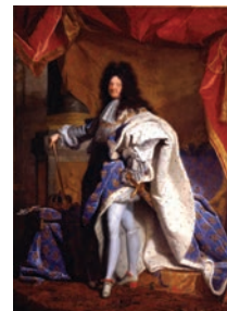
Portrait of Louis XIV , 1701 Hyacinthe Rigaud (Baroque)