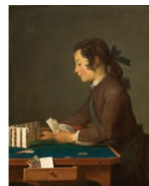
The House of Cards , 1737 Jean-Baptiste-Siméon Chardin (Rococo)