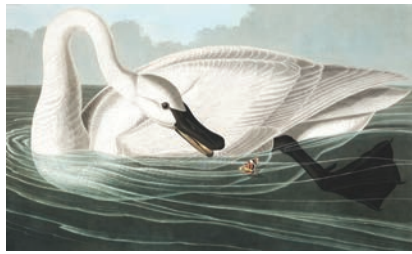
Trumpeter Swan , 1836-1838 John James Audubon (Realism)