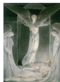
The Resurrection: The angel rolling away the stone from the sepulchre , c. 1808 William Blake (Symbolism)