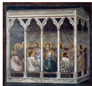
No. 39 Scenes from the Life of Christ: 23. Pentecost , 1304-1306 Giotto di Bondone (Pre Renaissance)