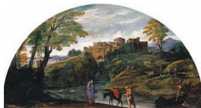
The Flight into Egypt , c. 1604 Annibale Carracci (Baroque)