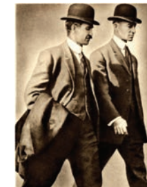
The Wright Brothers at the International Aviation Tournament , Belmont Park, Long Island, N.Y., October 1910 (Photograph)