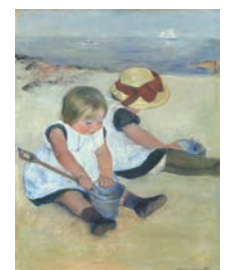
Children Playing on the Beach , 1884 Mary Cassatt (Impressionism)