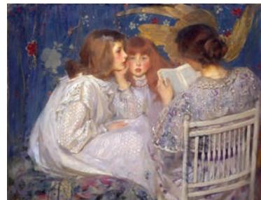
Jungle Tales , 1895 James Jebusa Shannon (Post-Impressionism)