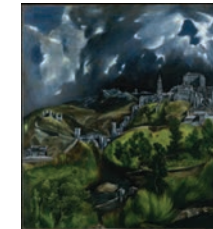
View of Toledo , 1596-1600 El Greco (Renaissance)