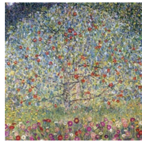
Apfelbaum I (Apple Tree I) , 1912 Gustav Klimt (Art Nouveau)