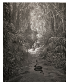
Satan as a Serpent, Enters Paradise in Search of Eve (from Milton's Paradise Lost ), 1868 Gustave Dore (Romanticism)