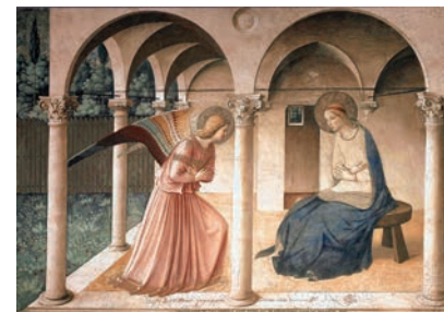
The Annunciation , 1438-1445 Fra Angelico (Renaissance)