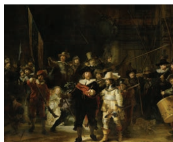
The Night Watch , 1642 Rembrandt van Rijn (Baroque)