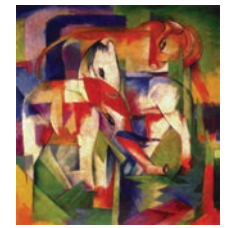
Elephant, Horse and Cow , 1914 Franz Marc (Modern Art - Expressionism)