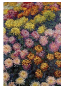
Bed of Chrysanthemums , 1897 Claude Monet (Impressionism)