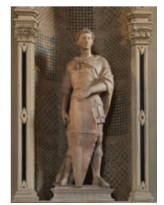
St. George , c. 1415-1417 Donatello (Renaissance)