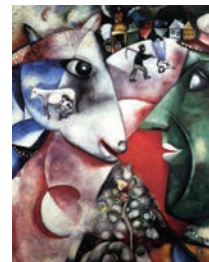
I and the Village , 1911 Marc Chagall (Modern Art - Cubism)