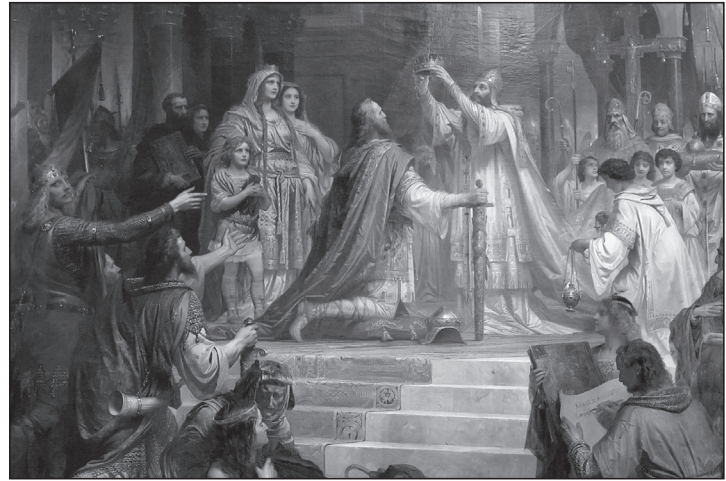
Coronation of Charlemagne by Friedrich Kaulbach, 1861

The Rise of Europe (4000 B.C.E.-1300 C.E.)